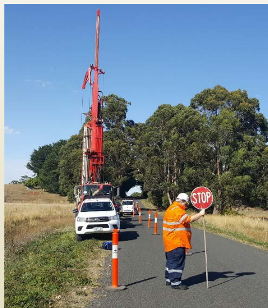
Above: one of our three exploratory bores in Trentham

We are currently extracting 32 megalitres a year and have the capacity to draw 46 megalitres.